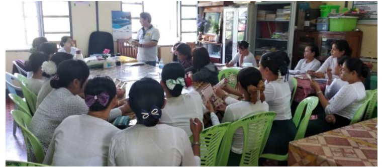
The Magic Bus team meets teachers in Hlaing Thar Yar township