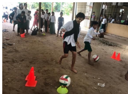
Children engage in activities during the weekly sessions