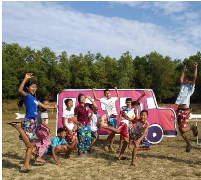
A day of fun to celebrate the work of Magic Bus