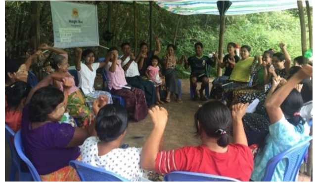
Parents at a quarterly meeting

In addition to weekly sessions with the children, we hold quarterly parent meetings to engage community members and encourage support for the programme among families. The meetings provide opportunities for staff to explain the Magic Bus vision, objectives and activities, and participants are invited to jointly discuss their children's performance, needs, and future development. Wider social issues are often raised, including the importance of allowing children to complete secondary education and to delay marriage.