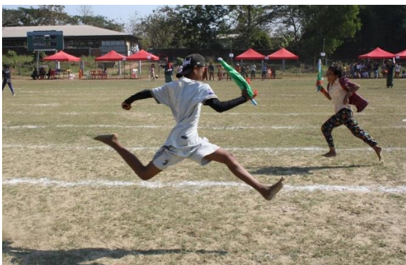
Children participate in races and other games