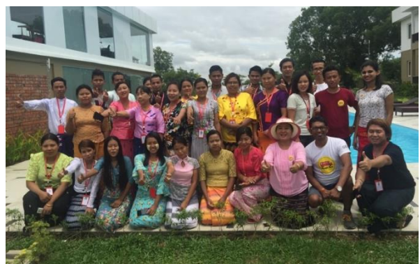
The Myanmar team with their trainers from India

Once a year, a five-day residential course is led by colleagues from Magic Bus India, who visit Myanmar to train our management staff, Youth Mentors and Community Coordinators. Participants discuss objectives for the upcoming year and practice new activities to conduct with the children. The annual internal training course ensures that the work in Myanmar is aligned with the broader Magic Bus programme, and that best practice is shared across teams.