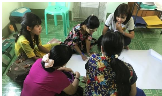
Community Coordinators during their monthly training session