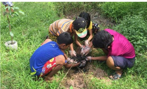
Children plant tree saplings