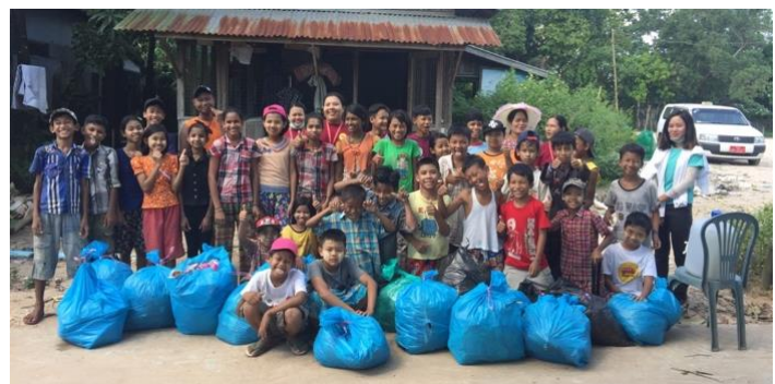
Participants after a successful clean-up event