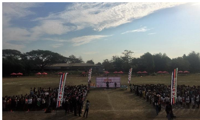
Communities and schools at the opening ceremony